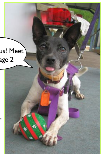
Baccus Foxy x 3yrs 5kgs

Some dogs, especially the small breed 'fluffies', come to DoggieRescue from the pound and before we even get to know their personalities—they have been adopted! Other dogs stay a few weeks, then find their 'forever' home, and some dogs often stay a few months before finding their new families. Then there are the dogs who stay for many months, perhaps for even years, before finding their special families. It is these doggies who stay longer to whom we become so attached to and who are our "Shelter Favourites!"