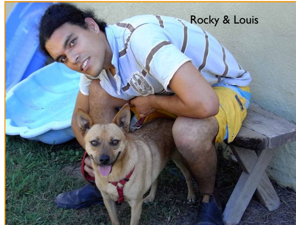
Rocky & Louis

From his endless big smile down to his wagging stubby tail Higgles is one of the happiest and energetic boys at DR! Higgles just loves company, both human and canine, and is always pushing his way in front of the other dogs to get the first scratch and cuddle. Why has he been at the shelter for so long? I think he is just waiting for the perfect family who can keep up with him!